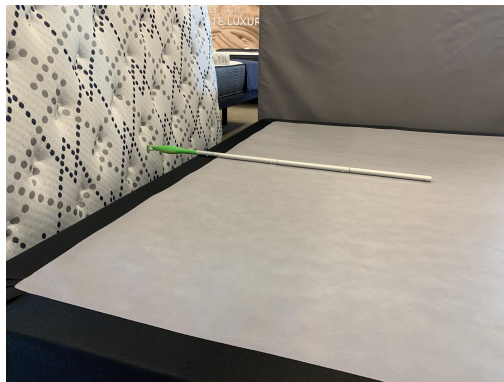
Picture for left side of the foundation/box spring set