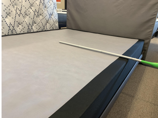
Picture for right side of the foundation/box spring set

Step 4 - If you have a foundation/box spring place your foundation/box spring back on the frame or furniture and place a straight edge (broom handle or yard stick) over the general area where you feel there is an issue while laying on your mattress. Measure to the lowest point (without putting any pressure down into the lowest point) and take two pictures as shown